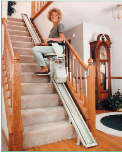
ELECTRA-RIDE II™ Model SRE-1550