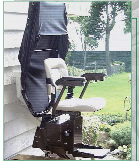
OUTDOOR ELECTRA-RIDE™ Model SRE-2000E

The only 400 lb. capacity outdoor stairlift... an INDUSTRY EXCLUSIVE!