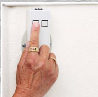
The two, wireless call/send controls make the installation simple and clean with no wires running along the wall.

Easy on-and-off thanks to the Electra-Ride II's unique design.