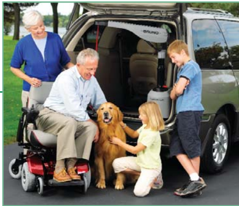
NEW CURB-SIDER™ VEHICLE LIFT VSL-672