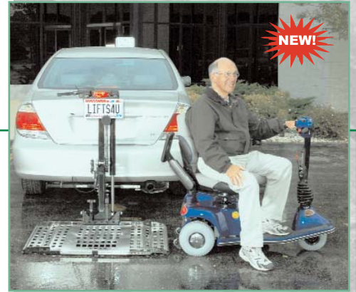
OUT-SIDER™ MERIDIAN™ LIFT ASL-250