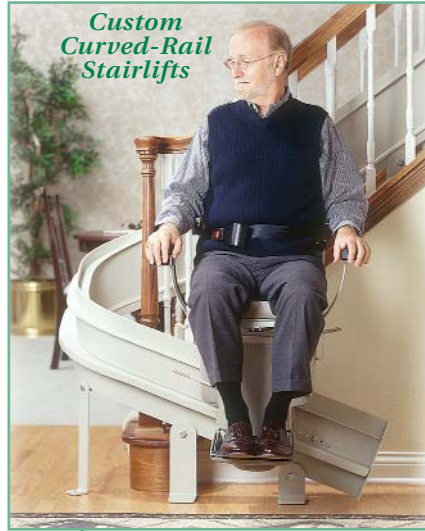
ELECTRA-RIDE III™ Model CRE-2100