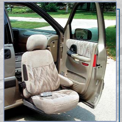
TURNY™ V (HD) SEAT

Revolutionary Turning Automotive Seating™ (TAS™)