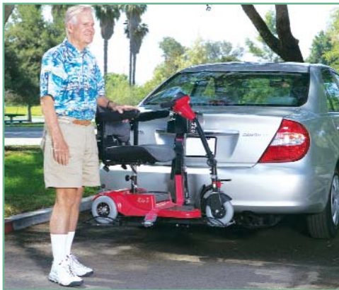
OUT-SIDER™ MICRO LIFT ASL-225