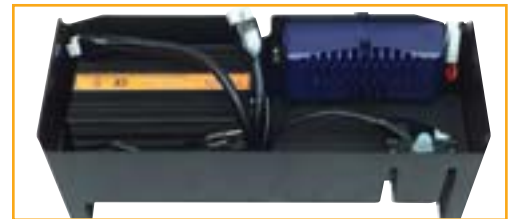
On-board self-diagnostics system