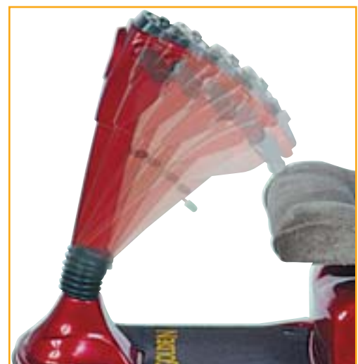
Patented infinite adjustable tiller