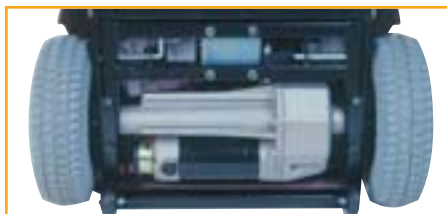
Quiet & maintenance free motor