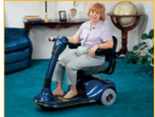
Attractive and affordable