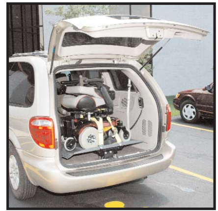
power platform into the minivan.