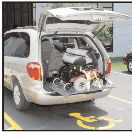
raise platform and secure the belts...