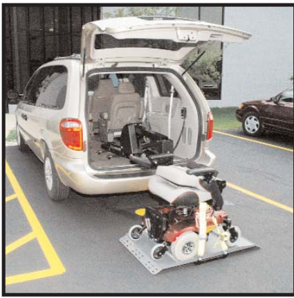
Power platform down & drive on...